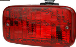
Rear Fog Light

RAF Alconbury Auto Hobby Shop DSN: 314-268-3701 COMM: +44 (0) 01480 843701